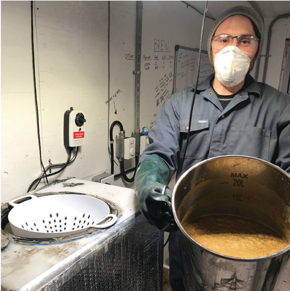
Preparing to feed the anaerobic digester.

“SDC is working with local talent to innovatively bridge the gap between sustainable mining activities and the protection of our traditional territory”